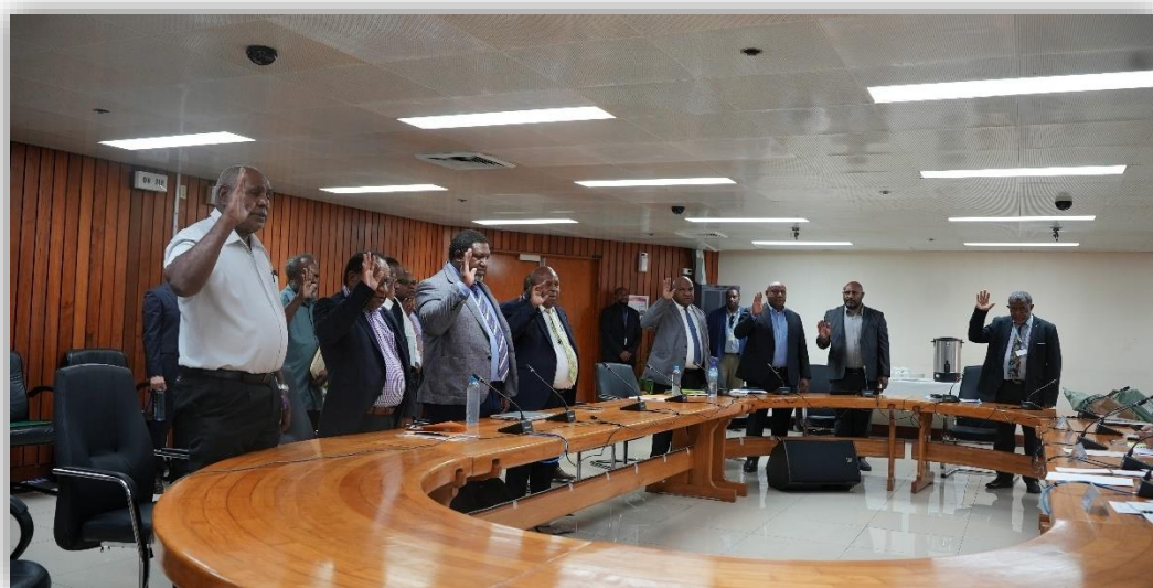
Photo 2 Swearing-In of Witness for Log Export Monitoring Second Hearing

The Committee is appreciative to all parties providing information through submissions, questionnaire responses and evidence at public hearings. The information received has greatly assisted the Committee in undertaking the Inquiry.