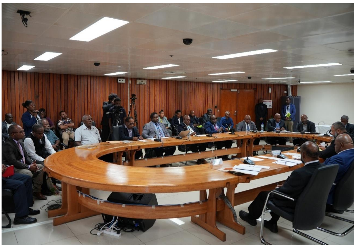
Photo 7. Inquiry into log export monitoring at B2 Conference Room, Parliament

The time for further inquiries is over; the time for resolute action is now.