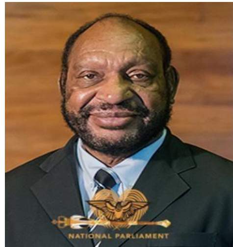
Grand Chief Sir Peter Ipatas, MP,