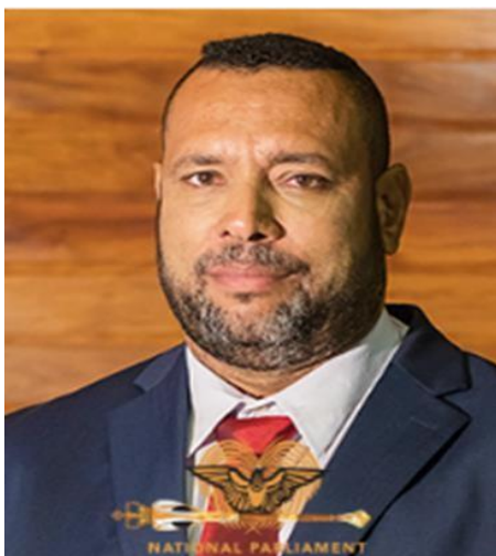
Hon. Allan Bird, MP