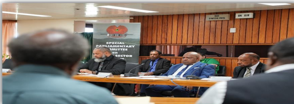
Picture: 1 Log Export Monitoring Hearing