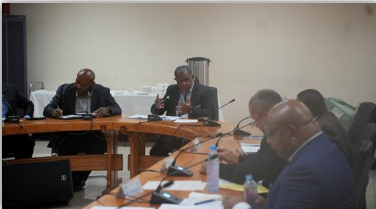
Photo 5. Inquiry into log export monitoring at B2 Conference Room, Parliament