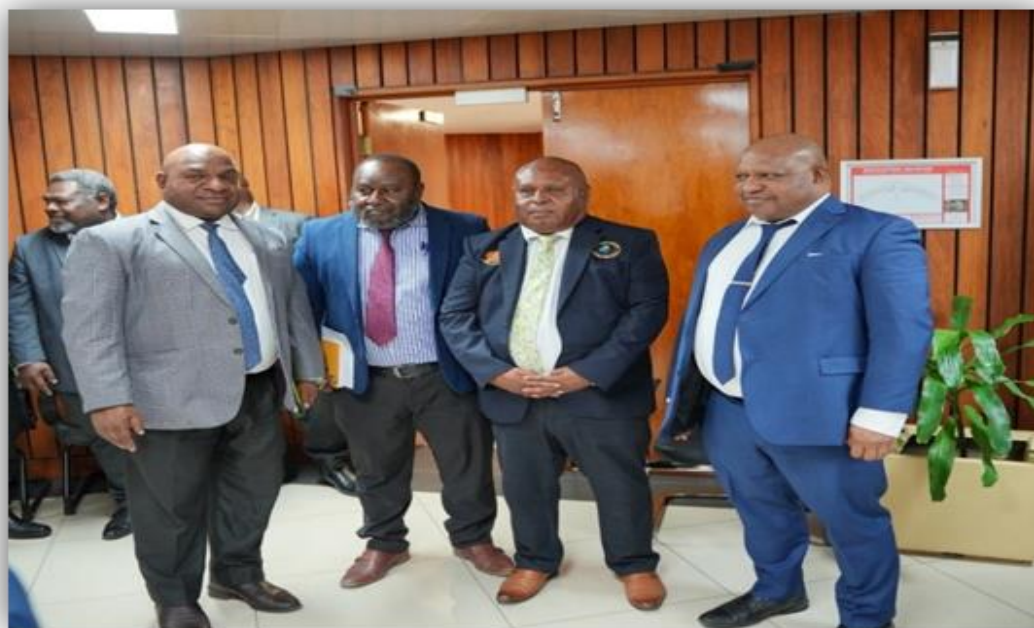
Photo 6. Inquiry into log export monitoring at B2 Conference Room, Parliament