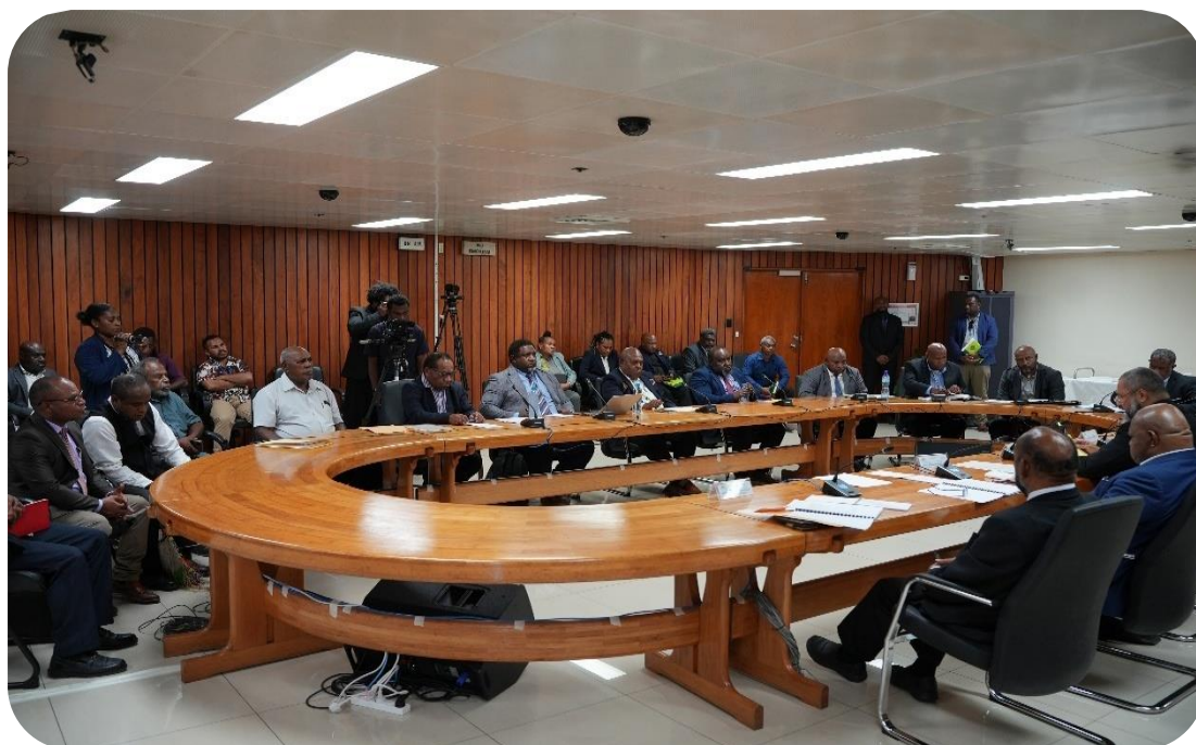
Photo 3 Forestry Hearing