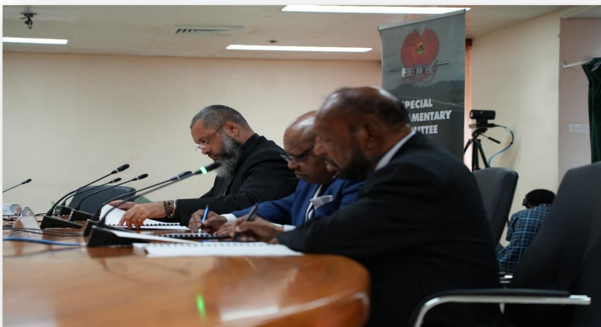
Photo 4. Committee Members during the Inquiry into log export monitoring

Picture 4: Committee Members during the Inquiry into log export monitoring